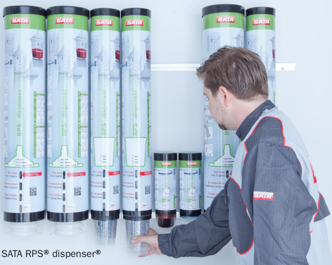
SATA RPS® dispenser®